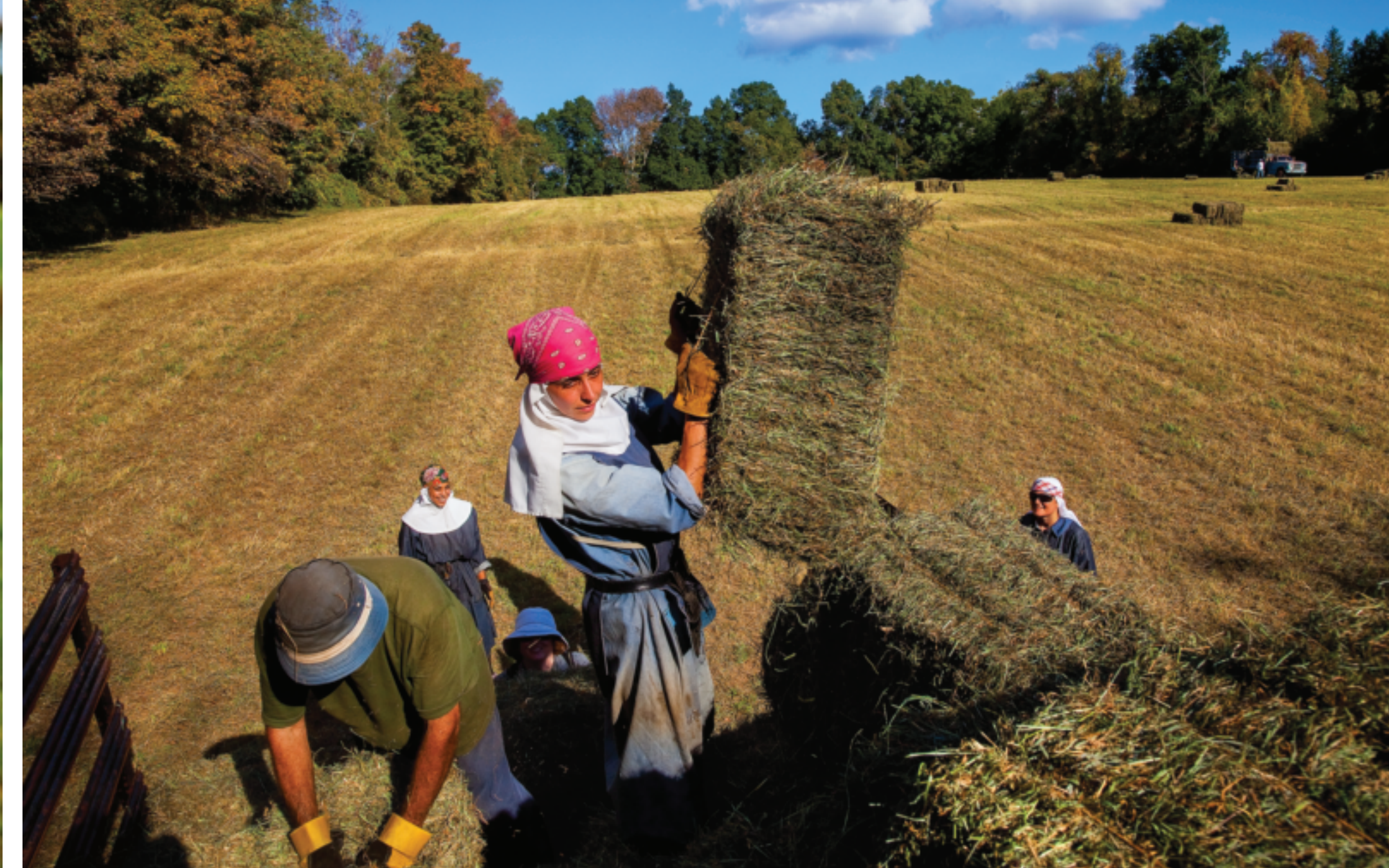
►Above: Nuns, interns, and volunteers from the community work together to haul hay. Last year the nuns baled 8,778 bales from their 11 hay fields.

"This is the family that you cannot deny, the mystery," explains the 35-year-old. "I think I always wanted this. It's not work. It's life. If